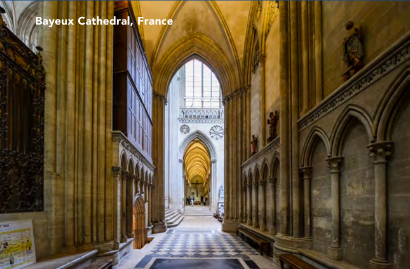
Bayeux Cathedral, France