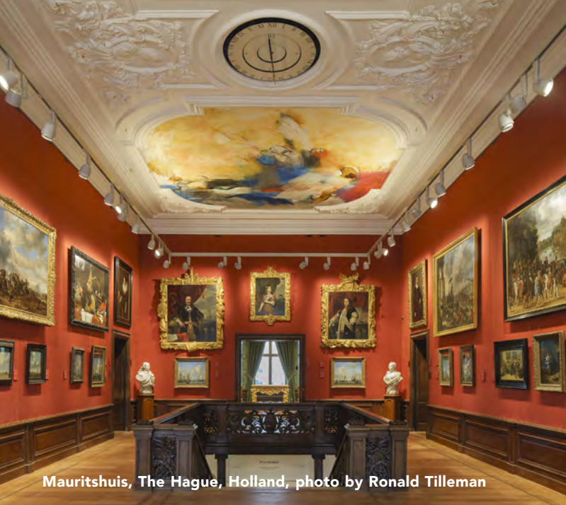
Mauritshuis, The Hague, Holland