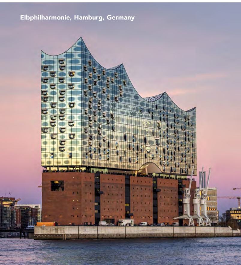
Elbphilharmonie, Hamburg, Germany