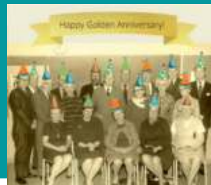
Board of Directors, Lake Forest-Lake Bluff Historical Society, 1972