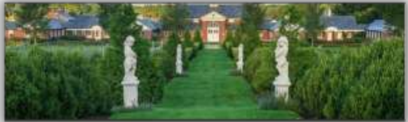
THE GARDENS AT 900 & ELAWA FARM