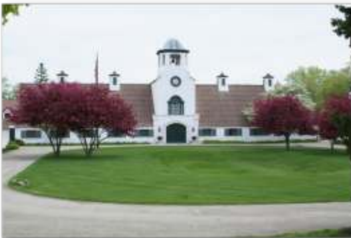
CRAB TREE FARM