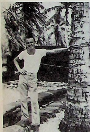
A MARINE SERGEANT IN THE MARSHALLS