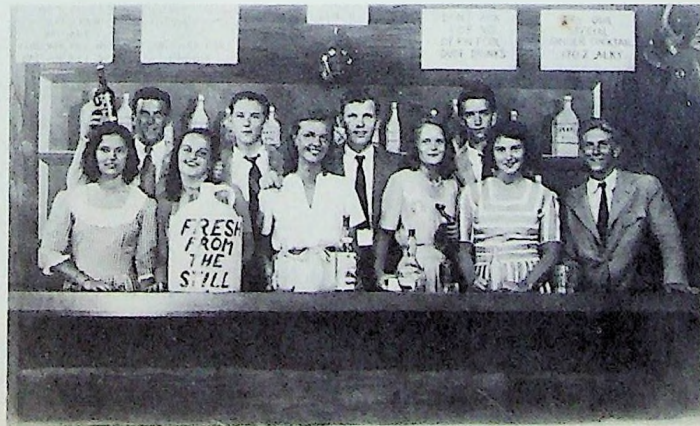
THE GIRLS THAT WOWED THEM THIS VACATION