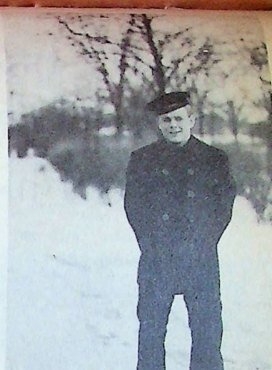
KEN'S ACQUIRED A SALTY STANCE