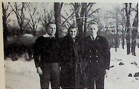
PRETTY NICE DUTY, EH WHAT.

Let's give everyone who helped secure these photographs a BIG HAND .. "Go thou and do likewise."