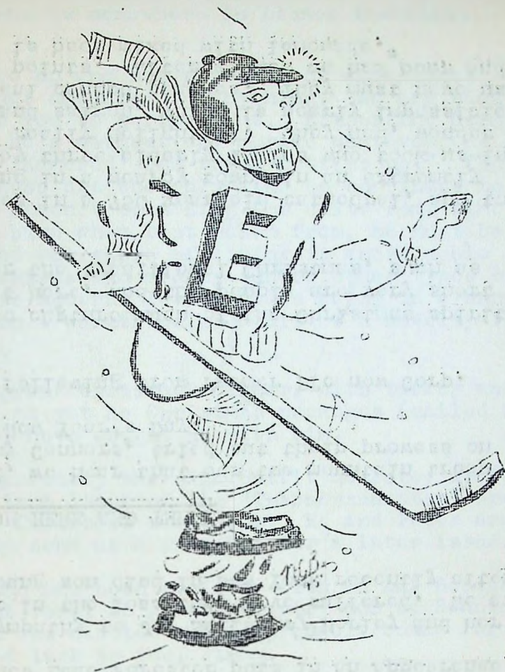
AN EAGER BEAVER AT THE WINTER CLUB