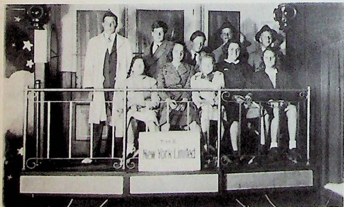
ANOTHER GUESSING GAME