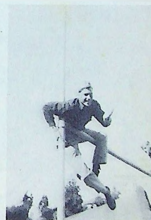
WHAT'S COOKING, CLIVE?